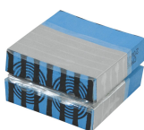
CM PE module with Multidiameter™