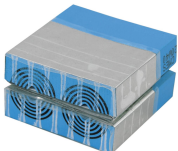
CM ES module with Multidiameter™